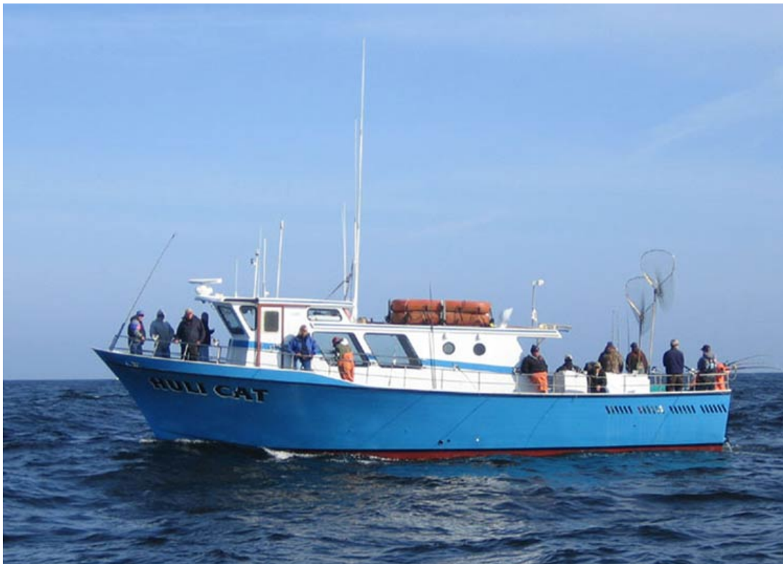
This is the Huli Cat, the pale blue hull is the field mark!