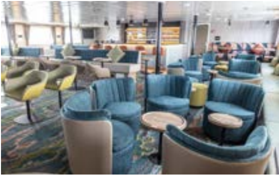
Bar & Observation lounge