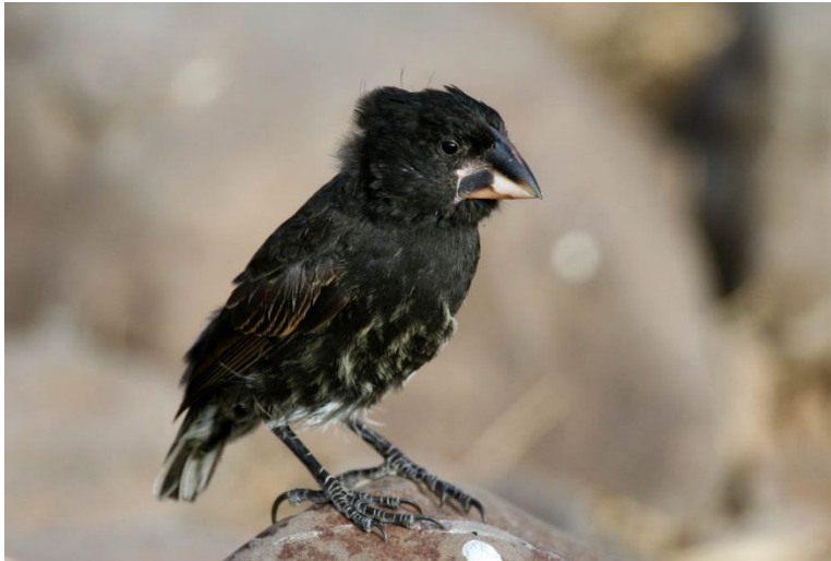
Española Ground-Finch - Española Island.