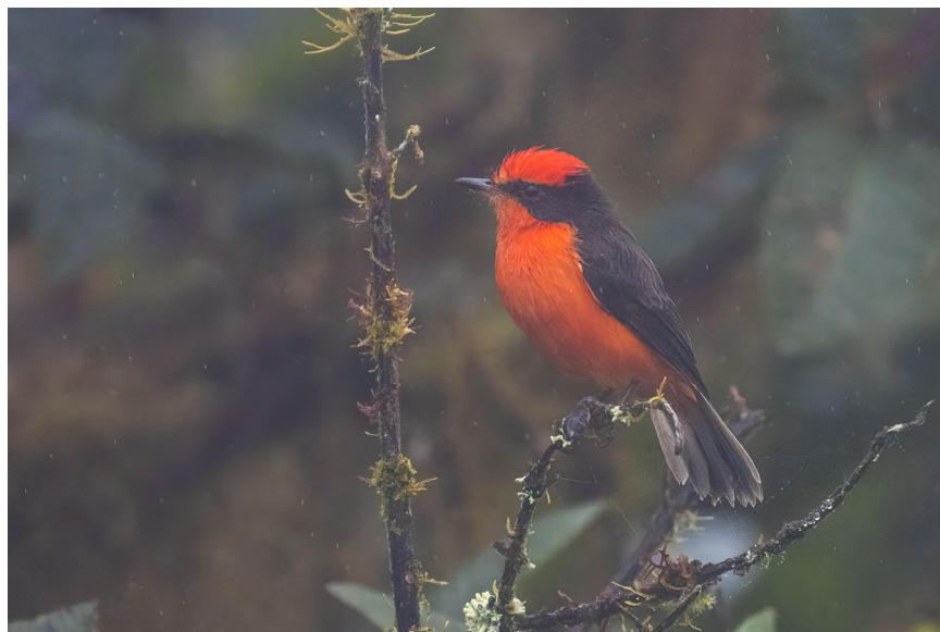
Brujo Flycatcher – Alvaro was instrumental in the work to separate this as a different species from Vermilion Flycatcher!

visiting most of the islands with endemic or specialty birds! This is a unique trip for a birder. Keep in mind that seeing the Mangrove Finch has become impossible in recent years, as restrictions to visits of its habitat are in place. We hope that our special itinerary will allow us to sample a much greater diversity of birds, landscapes and wildlife than most trips, but realize that the final itinerary is not given the go ahead by the National Park until very shortly before we depart. Galapagos is spectacular, and amazing, you will love the trip we have in store for you. Our smaller group size (14), on a stable catamaran, allows for a more intimate visit than on a larger ship. The Galapagos is best with a small boat and group, giving an intimate and once in a lifetime type of experience.