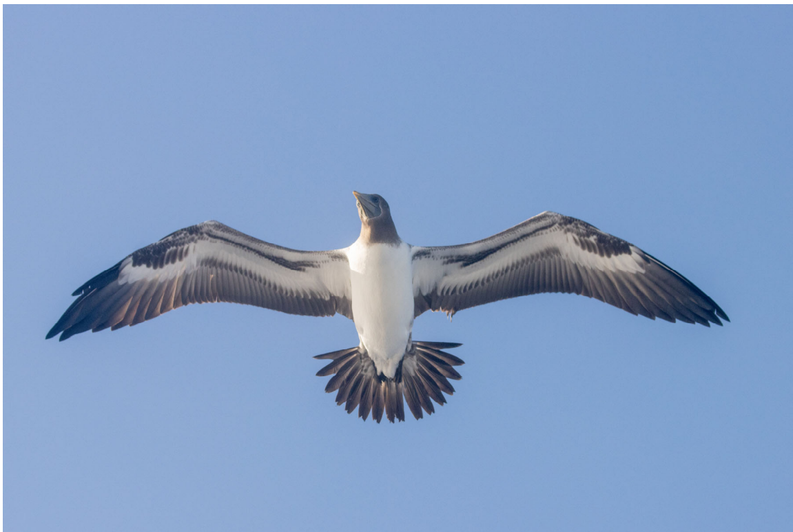
A Young Nazca Booby flies over.

Española Island , previously known as Hood , is one of the smaller Galapagos Islands, measuring 7 by 14 km and reaching an elevation of just over 200 m. Española is the oldest Galapagos Island, or at least the island on which the oldest lavas have been found. These lavas are 3.4 million years old as determined by K-Ar dating. It hosts nearly all of the world's Waved Albatross, magnificent birds of enormous wingspan. The southern cliffs provide the elevation these large birds need to take off. Many other birds, such as the Red-billed Tropicbird, may also be seen there and often this island is a great place to see not only the nesting boobies and Swallow-tailed Gulls but predatory Galapagos Hawks. The Española race of marine iguanas have particularly striking red coloration. In the northeast of the island at a site called the blowhole , wave energy focused by cracks in the rocks produces enormous geyser of seawater to the delight of onlookers. The friendliest of the Galapagos mockingbirds is found here, the Española Mockingbird and it has an endemic Darwin's Finch, the Española Ground-Finch.