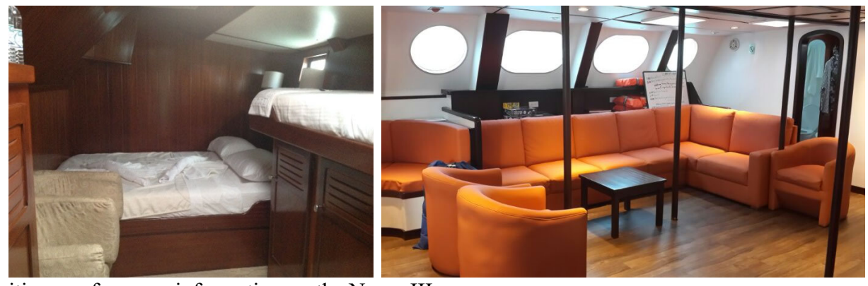
itinerary for more information on the Nemo III.

The Nemo III is a large Trans-oceanic 75-foot multi-hull yacht for cruising and charters. It has been in the Galapagos since 2014. This large and comfortable catamaran was specially built to take up to 16 passengers housed in 8 cabins, each with private bathroom. It has a Jacuzzi on deck, and sea kayak for exploring during down time. See the back pages of this