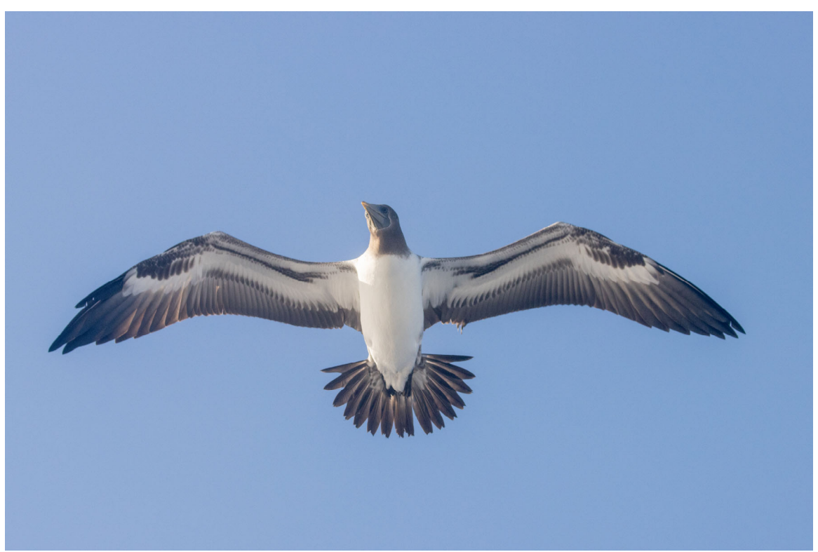
A Young Nazca Booby flies over.

Española Island, previously known as Hood , is one of the smaller Galapagos Islands, measuring 7 by 14 km and reaching an elevation of just over 200 m. Española is the oldest Galapagos Island, or at least the island on which the oldest lavas have been found. These lavas are 3.4 million years old as determined by K-Ar dating. It hosts the main world colony of Waved Albatross, magnificent birds of enormous wingspan. The southern cliffs provide the elevation these large birds need to take off. Many other birds, such as the Red-billed Tropicbird, may also be seen there and often this island is a great place to see not only the nesting boobies and Swallow-tailed Gulls but predatory Galapagos Hawks. The Española race of marine iguanas have particularly striking red coloration. In the northeast of the island at a site called the blowhole , wave energy focused by cracks in the rocks produces enormous geyser of seawater to the delight of onlookers. The friendliest of the Galapagos mockingbirds is found here, the Española Mockingbird and it has an endemic Darwin's Finch, the Española Ground-Finch.