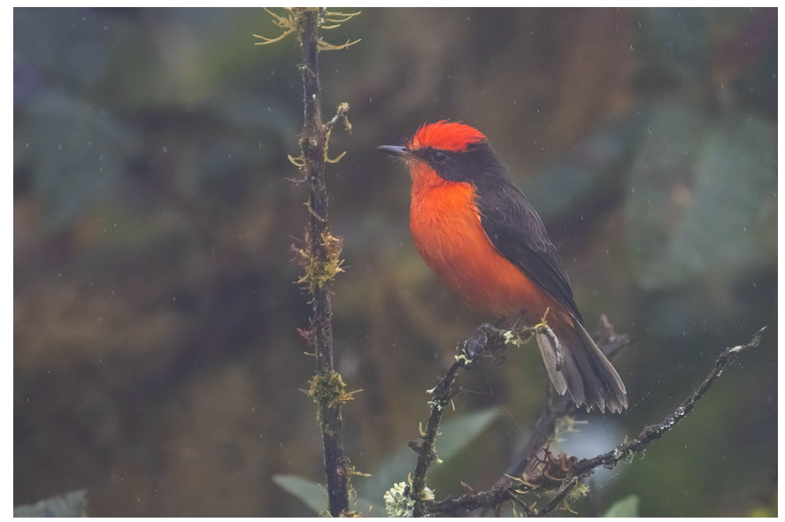
Brujo Flycatcher – Alvaro was instrumental in the work to separate this as a different species from Vermilion Flycatcher!

visiting most of the islands with endemic or specialty birds! This is a unique trip for a birder. Keep in mind that seeing the Mangrove Finch has become impossible in recent years, as restrictions to visits of its habitat are in place. We hope that our special itinerary will allow us to sample a much greater diversity of birds, landscapes and wildlife than most trips, but realize that the final itinerary is not given the go ahead by the National Park until very shortly before we depart. Galapagos is spectacular, and amazing, you will love the trip we have in store for you. Our smaller group size, on a stable catamaran, allows for a more intimate visit than on a larger ship. The Galapagos is best with a small boat and group, giving an intimate and once in a lifetime type of experience.