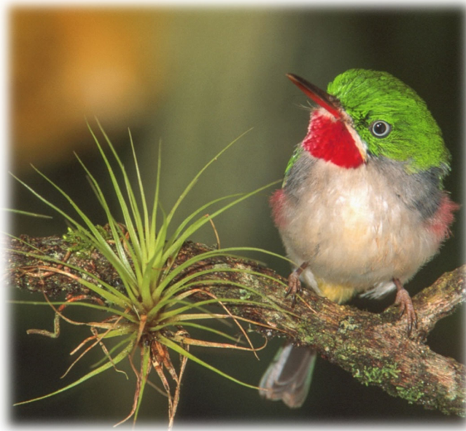
Narrow-billed Tody

RESPONSIBILITY: For and in consideration of the opportunity to participate in the tour, each tour participant and each parent or legal guardian of a tour participant who is under 18 agrees to release, indemnify, and hold harmless Alvaro's Adventures, its agents, servants, employees, shareholders, officers, directors, attorneys, and contractors as more fully set forth in the Release and Indemnity Agreement on the reverse side of the