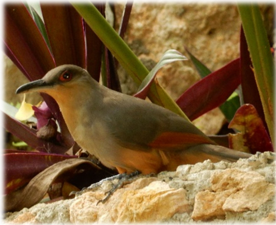
Hispaniolan Lizard-cuckoo (©Héctor Andújar)

April 5 – 14, 2026 Guided by Arturo Kirkconnell and second guide if needed.