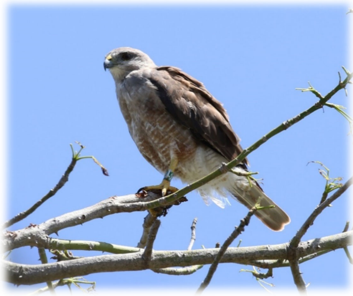
Ridgway's Hawk

should have an adequate number of blank pages for the entire journey, Dominican Republic generally asks for two pages for entry and exit stamp.