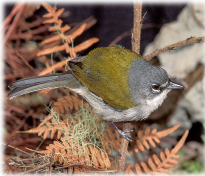
White-winged Warbler

This area is very important for the Antillean Piculet, and Flat-billed Vireo. Other species we may find include Olive-throated Parakeet, among others we may have missed on previous days. Lunch and dinner at Ramada restaurant, Duverge. Night at Ramada lodge. In the afternoon we will look for any species we have missed so far, or to obtain better views of local specialties.