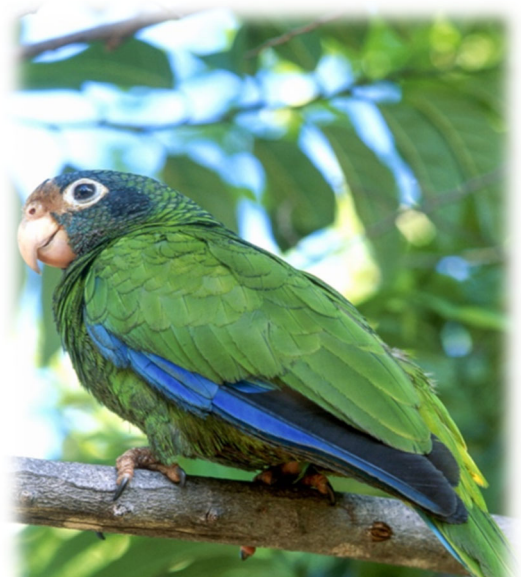
Hispaniolan Parrot

We strongly recommend you consider purchasing trip cancellation (including medical emergency) insurance to cover your investment in case of injury or illness to you or your family prior to or during a trip. Because we must remit early (and substantial) tour deposits to our suppliers, we cannot offer any refund when cancellation occurs within 70 days of departure, and only a partial refund from 70 to 119 days prior to departure (see CANCELLATION POLICY). In addition, the Department of State strongly urges Americans to consult with their medical insurance company prior to traveling abroad to confirm whether their policy applies overseas and if it will cover emergency expenses such as a medical evacuation. US medical insurance plans seldom cover health costs incurred outside the United States unless supplemental coverage is purchased. Furthermore, US Medicare and Medicaid programs do not provide payment for medical services outside the United States.