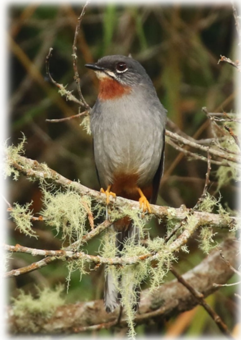
Rufous throated Solitaire

April 11, 26. Day 7 – CABO ROJO AND TRAVEL TO SANTO DOMINGO. We will begin with breakfast at 7:00 am at the lodge. The Cabo Rojo wetlands are a locality near the southern slope of Sierra de Bahoruco. Here we might encounter White-cheeked Pintail, White Ibis, Hispaniolan Mango, Vervain Hummingbird, Stolid Flycatcher, Village Weaver, wintering ducks and shorebirds. Here we also hope to find Mangrove Cuckoo and Mangrove (“Golden”) Warbler. The bluffs around the cape provide nesting habitat for White-tailed Tropicbird, Cave Swallow and Caribbean Martin, and Brown Booby offshore. Near Pedernales some landbirds can be watched: Black-crowned Palm-Tanager, Hispaniolan Woodpecker, and Greater Antillean Bullfinch. Near Pedernales some landbirds might also be seen: Black-crowned Palm-Tanager, Antillean Piculet, Hispaniolan