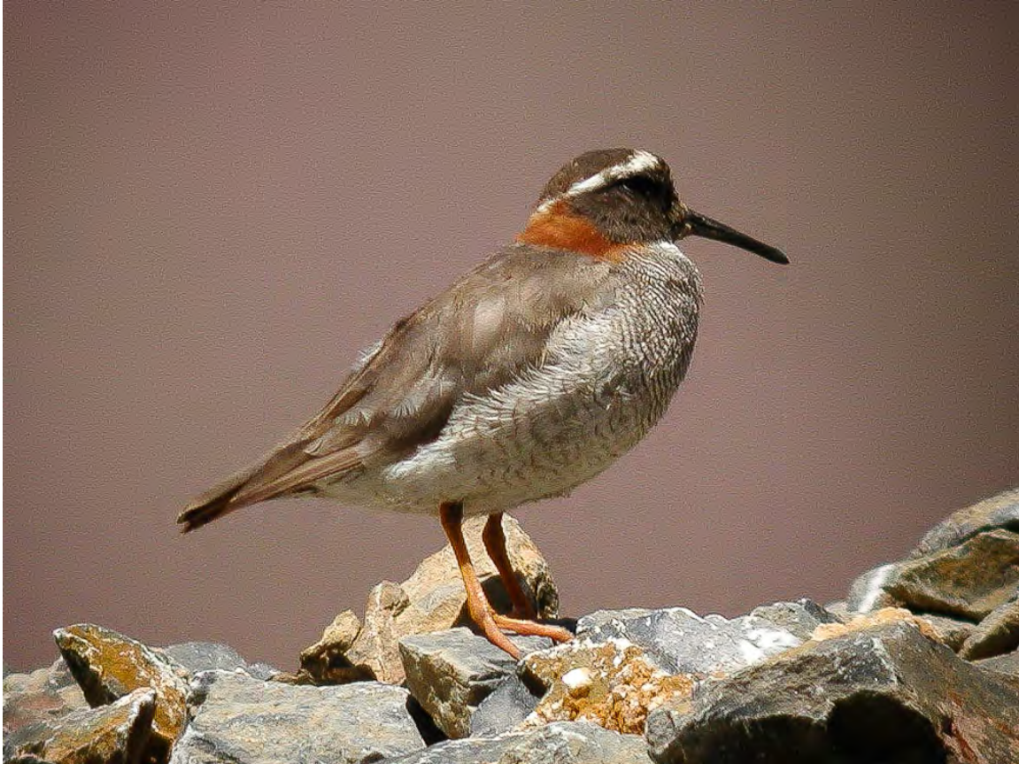
Diademed Sandpiper-Plover - Wow!

The second region in Chile we will bird is the central coast, visiting various estuaries, beaches, coastal lagoons and rocky headlands. The coast here is similar to that of Central California, not only in its look but in the cool breeze which always seems to be flowing. Just offshore there may be many Peruvian Pelicans, Peruvian Boobies, Guanay Cormorants, Grey Gulls and the beautiful Inca Tern. This underscores the fact that this is amongst the richest ocean areas anywhere on earth. If that much can be seen from the coast, then what is out there in deeper water? The answer is more albatrosses that you can dream of, from the smaller Black-browed and Buller's to the larger Salvin's or the huge Northern Royal, it is a pelagic feast out there. Wilson's Storm-Petrels zoom by, with hundreds of shearwaters, giant-petrels, scavenging Westland and White-chinned Petrels and maybe even the gadflys – like Juan Fernandez Petrel. And that funny looking loon swimming around, well, it's a Humboldt Penguin! Even if you have been on a hundred pelagics, a trip out of Valparaiso is like no other, it is just chock-full of birds. Best part of it is that you can be done early enough in the day to get back for a late lunch!