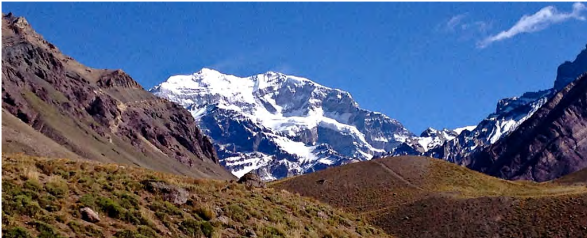
Mt. Aconcagua in the distance.

unique part of the country – this is why wines are grown here, the specific desert-like climate type is not common in Argentina. The birds here sort out into those found in the foothills and those found in the lowlands. We will visit these two areas and make sure we sample all of what this area's bird life offers to experience. We will have days devoted to birds, and a day devoted to wine, and some superb food! Argentina's world-renowned beef will be on the menu, as well as Malbec and maybe some rarer varieties you may have never heard of! Torrontes anyone? As we taste, we will chat and learn about what makes Argentina the fantastic nation it is. The influence of the Gaucho is still strong this far west in Argentina, and how the culture of roving "cowboys" has shaped this nation is imperative in understanding the greater confidence and swagger of the Argentines versus the Chileans. Birds will be our reason for coming down here, but they are an avenue to a rich travel experience. By the end of this trip you will not only have a good idea of the birds, but also the food, culture, idiosyncrasies, scenery and yes...the wonderful wine of these two neighboring countries. You don't want to miss this incredible tour!!