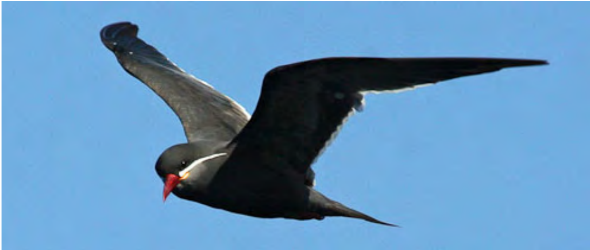
The gorgeous Inca Tern.

road. Do not book a flight before 8 pm. If you are continuing to Easter Island, you will overnight at the airport hotel.