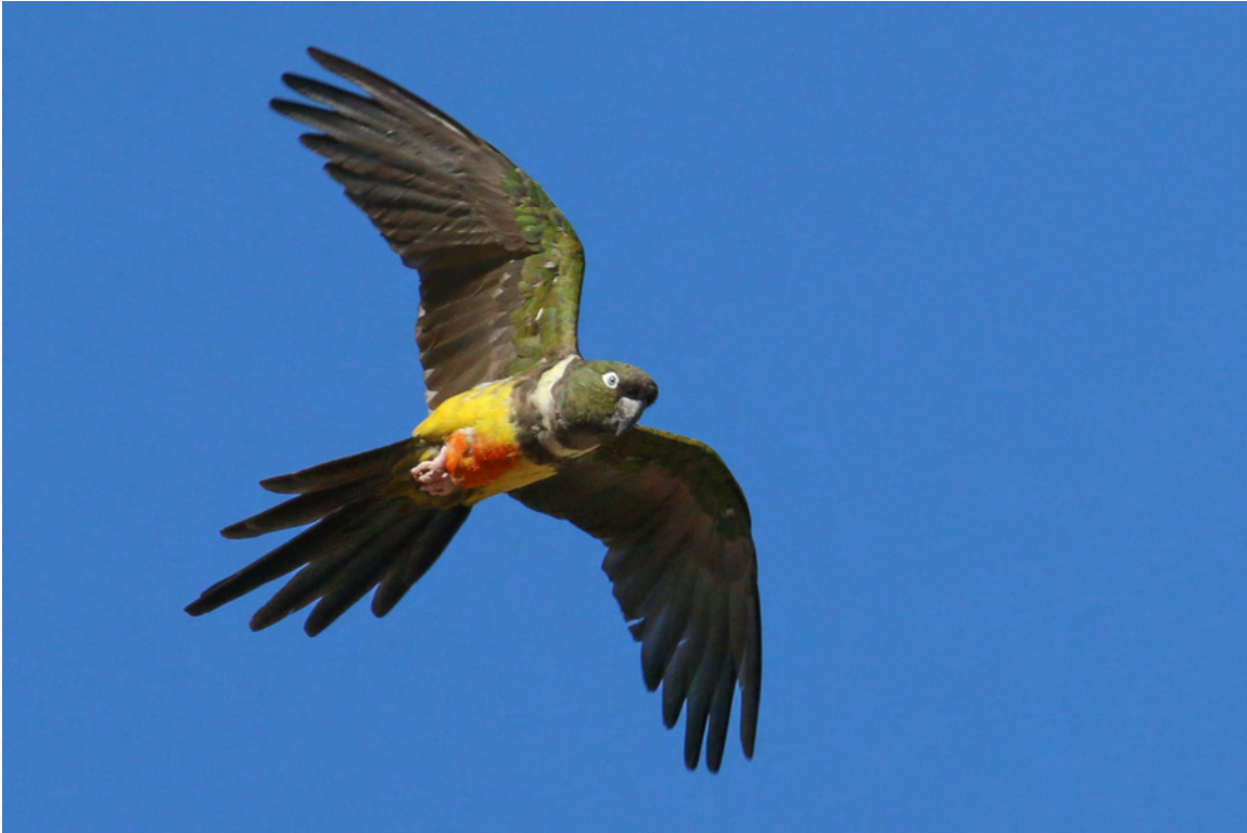
Burrowing Parakeet – nearly as big as a macaw!

Mendoza – San Juan lowlands – The city of Mendoza is positioned such that it is right at the interface between the lowlands and the foothills. One drives to the east of the city and you have almost nothing but flat land until you reach Buenos Aires! Much of this area is a little birded region known as the Monte Desert, noted above as the home of the Sandy Gallito. Well it is also the area frequented by the Cinnamon Warbling-Finch and perhaps a White-banded Mockingbird, or a handsome Elegant-crested Tinamou. There may be more Monte Desert species that have gone ignored or are lost in muddled taxonomy. There is a siskin here that appears to have only a female like plumage, not a bright yellow and black one as in most males in this group. Could this be a new species? Perhaps! There is a newly recognized Argentine endemic, formerly considered an isolated race of the Greenish Yellow-Finch. This newly crowned Monte Yellow-Finch is a species we could see on our trip! The lowlands of Mendoza have many secrets to divulge to us, and we hope you see the beauty and allure of this seldom-birded region – particularly as you sip on that local Malbec! In 2016 and 2020 we saw a Spotted Rail here, that was a wow moment, and in 2017 we made a range extension for the Tropical Screech-Owl.