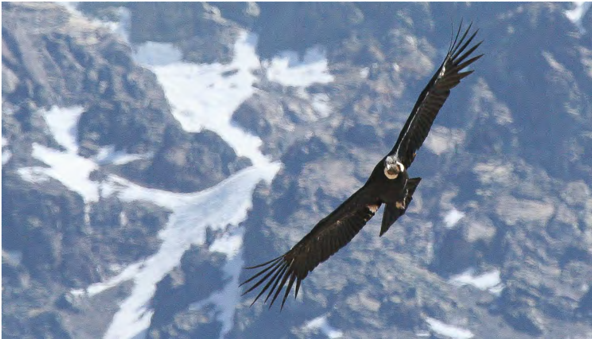
His Majesty - The Andean Condor – National bird of Chile.

Chile is a fantastic birding nation, with absolutely wonderful scenery, some of the best in the world! Not to be outdone, neighboring Argentina is an absolute gem, with fantastic vistas, and a largely different and unique avifauna. These two nations are separated by the highest section of the majestic Andes, at roughly the same latitude here we find two of the most up and coming internationally renowned wine regions. Hmmmmm – so why not go birding in both countries, and do a little wine tasting while there? This is how Chile-Argentina Birds & Wine was born, some years ago. We were the pioneers in this concept, offering it before anyone else was doing it! You can blame us. Keep in mind that this is a tour that samples only a subset of the birding areas of both of these countries, it is not a comprehensive survey tour. But within the regions we visit, it surely is both complete as well as utterly enjoyable. Many participants have commented that this is the best bird tour they have ever been on, and these were experienced travelers. Taking the time to