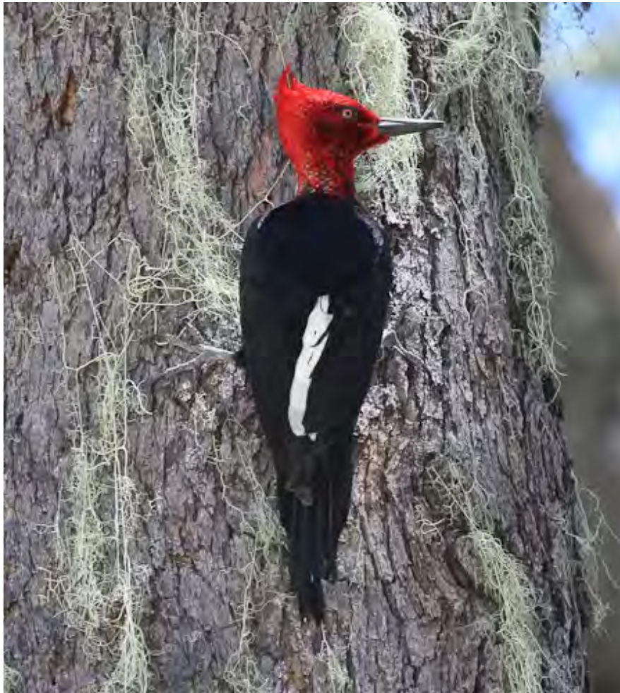
Magellanic Woodpecker - a male.

although Cabernet Sauvignon and Spanish Tempranillo are also planted here. A curiosity is that nearly a quarter of the area is planted with varieties that are never exported – Criolla Grande and Cereza. These are old lineages of grapes, and although they are used to make high volume box wines!