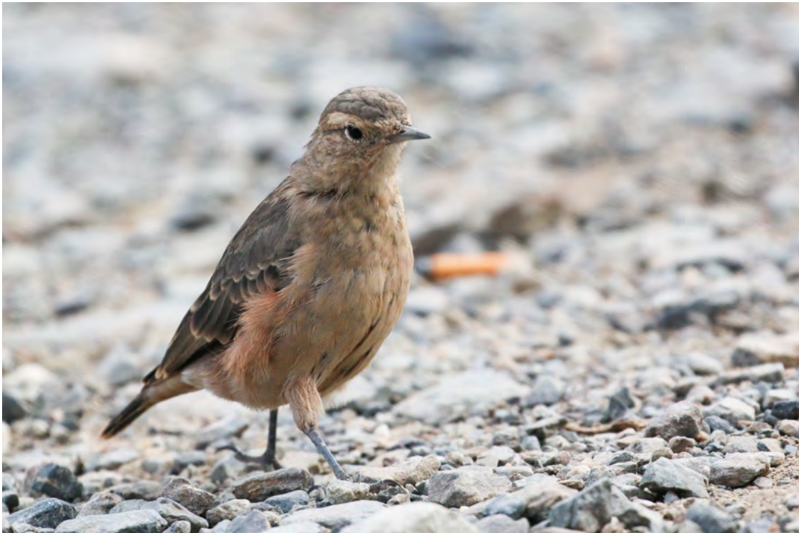
Rufous-banded Miner – two cryptic species might be seen on our tour, they look the same but sound different. More than meets the eye in this mountain species.

The timing of the tour is towards the end of the growing season, both for birds and for grapes. We will be there just after summer vacation, so we avoid the crowds that would be found in parks, coasts, and hotels earlier in the season. Bird wise it is a great time as most of the migratory breeding birds are still in the area while at the same time some migrants from farther south are beginning their movements northward. During this time of the year we may see some of the grape harvest and be able to taste the grapes themselves.