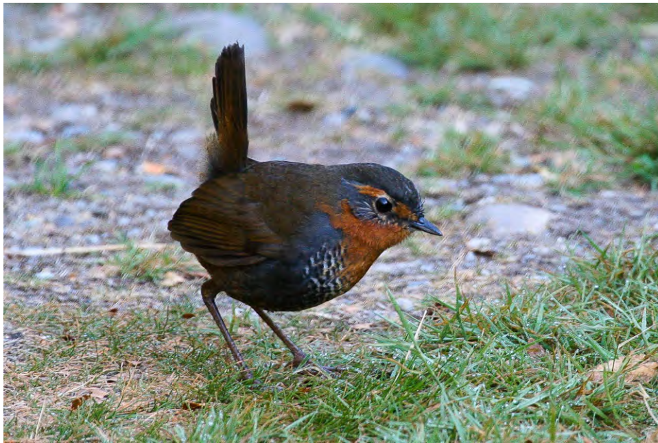
Chucao Tapaculo - a perky little guy, when not hiding in bamboo!

Finally, in Chile we head south to the northern edge of the Patagonian Forest. We do not have a huge amount of time here, but it will be a great introduction to the southern forest. Here massive stands of southern beech ( Nothofagus sp. ) hold a wonderful assortment of birds, from colorful Patagonian Sierra-Finches, the creeper like Thorn-tailed Rayadito, to Chile's version of the nuthatch, the White-throated Treerunner. But if we are lucky as can be, a Magellanic Woodpecker may show up for us. They are not abundant this far north, but we do stand a pretty good chance of seeing one. Add to this Alvaro's favorite bird in the world, the Chucao Tapaculo and its larger cousin, the Chestnut-throated Huet-Huet and we have quite a few cool possibilities, although these two species can be difficult to see. Again, we need a bit of luck, or perhaps an extra glass of wine at the end of the day depending on how it goes. A tad north of our forest birding sites is the Colchagua Valley, one of Chile's premier wine growing regions. Home to Montes, Viu Manent, Casa Silva, Casa Lapostolle and many other wineries. Here we shall tone down the birding and ramp up the food and wine. It will be a nice change of pace in a beautiful wine growing area of the country, where we shall be able to immerse ourselves in the wine.