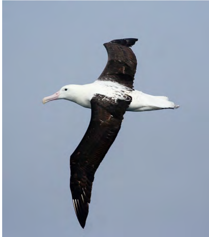
Northern Royal Albatross - The Big Guy!

Valparaiso and the Coast — The Humboldt Current region is amongst the most productive, perhaps the most productive part of the world's oceans. Here we have an effect of a cold-water current that sweeps north from more polar regions, as well as winds that cause an upwelling effect off the coast of Chile. Both of these elements create a heck of a lot of nutrients to be thrust into areas with ample sunshine, allowing various creatures to feast, grow, multiply and feed other creatures. Up at the top of the food chain are the birds, and man are there lots of them. Here we could go out and see up to five species of albatross, and sometimes hundreds of individuals! The huge Northern Royal Albatross is a regular, although uncommon, component of the feeding flocks. Thousands of Sooty and Pink-footed Shearwaters may be around along with the two species of Giant Petrel, Westland and White-chinned Petrels as well as "Fuegian" Wilson's Storm-Petrel. An uncommon but regular species we look for is the alcid-like Peruvian Diving-Petrel; a family entirely separate from the true petrels. Closer to shore we can enjoy groups of Peruvian Booby, both Guanay and Red-legged Cormorants, Franklin's Gulls, and often lots of the gorgeous Inca Tern. The late summer, and early fall season are particularly good for finding the Juan Fernandez Petrel off Valparaiso, and maybe a surprise or two.