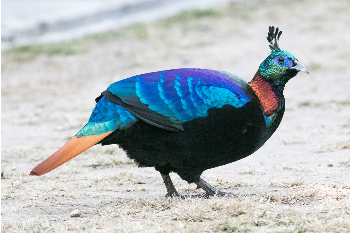
Himalayan Monal - a real "wow" bird.