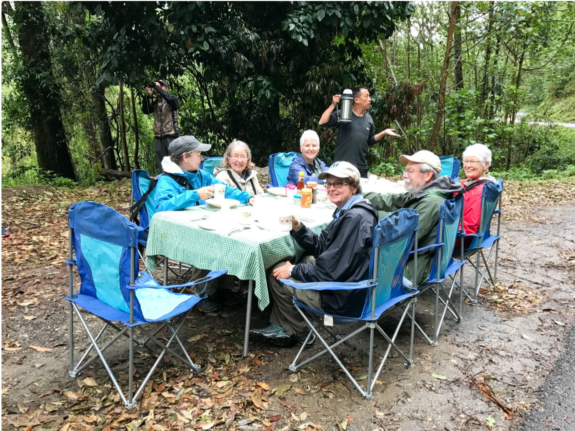
Breakfast time in Bhutan.