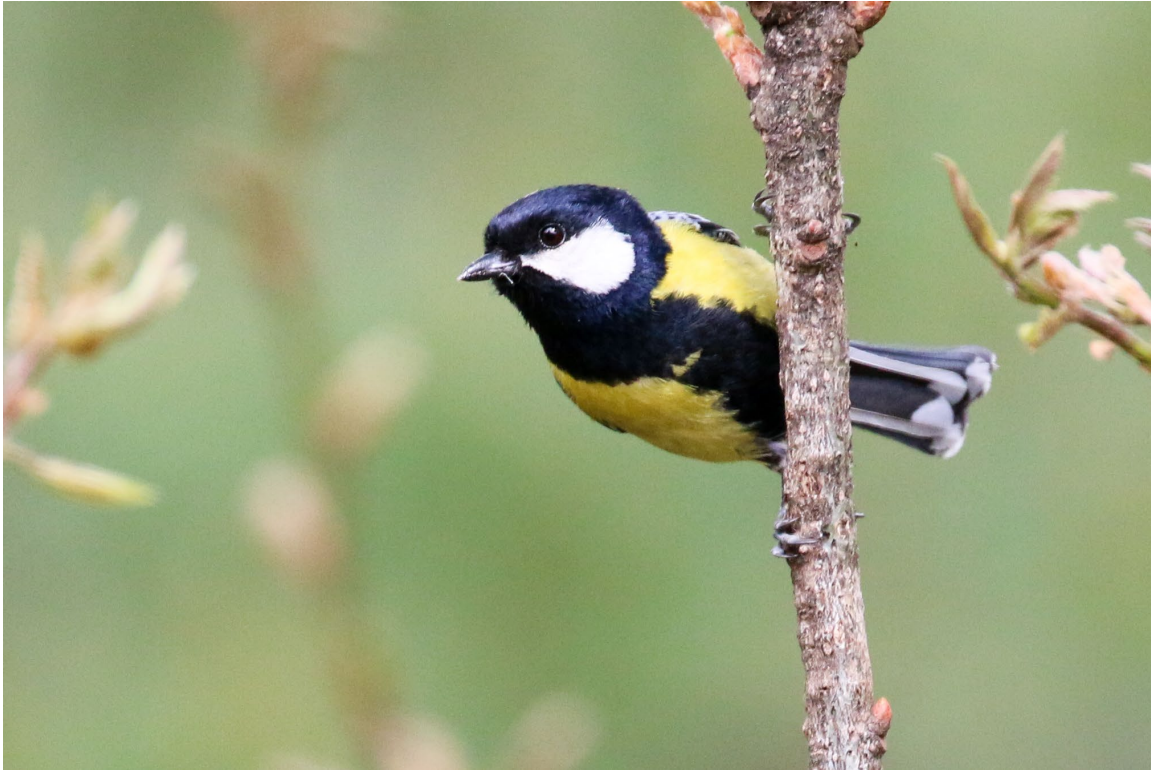
Green-backed Tit, a close relative of the Great Tit.