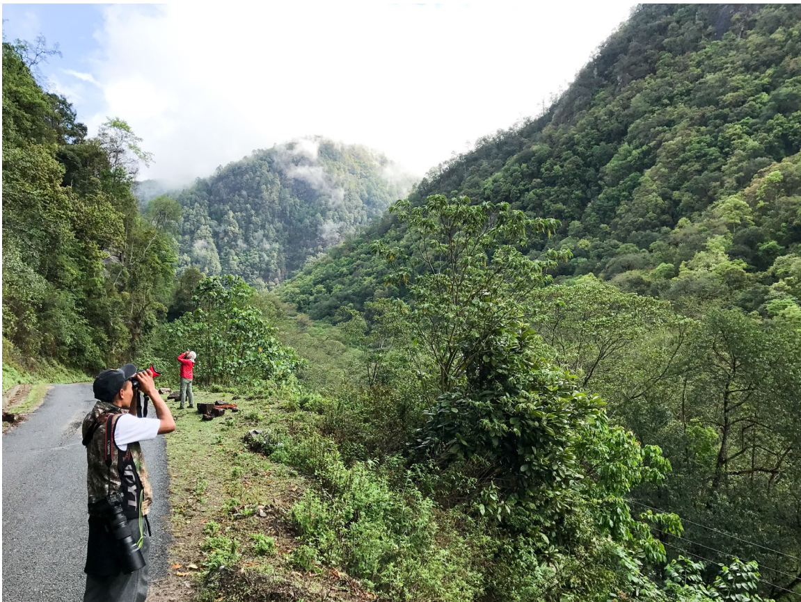
Birding in Bhutan.

If you do the hike to the Tiger's Nest it is a hike of a couple of hours non-stop to reach the temple, and an hour and a half to return. It is not strenuous, but it is long and may not be for everyone. It is optional. We may also take at least one downhill hike through a forest trail, a hike of 1.5 miles or so. It is a walk that can be skipped if you are not up to it. Otherwise, the birding is pretty relaxed and from level surfaces.