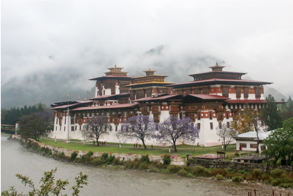
One of the most fantastic buildings you will ever see, Punakha Dzong.