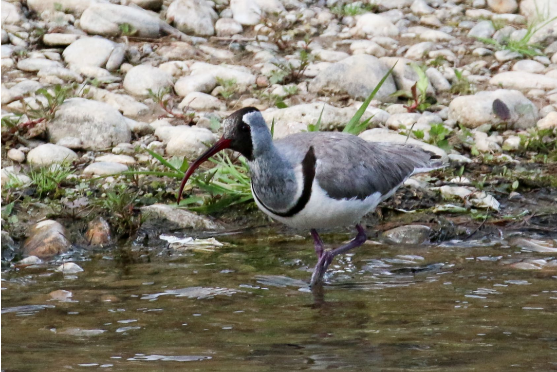
The unique Ibisbill, common in Bhutan.

Alvaro's Adventures is returning to Bhutan. It is a fantastic trip, to watch birds and visit the Himalayas and the distinctive Buddhist culture of Bhutan. Alvaro will team up with expert local birding guides to offer an authoritative, yet distinctly fun and informative tour of the birds and natural areas of Bhutan. This promises to be a highlight for any birder interested in seeing one of the most distinctive of countries and cultures.