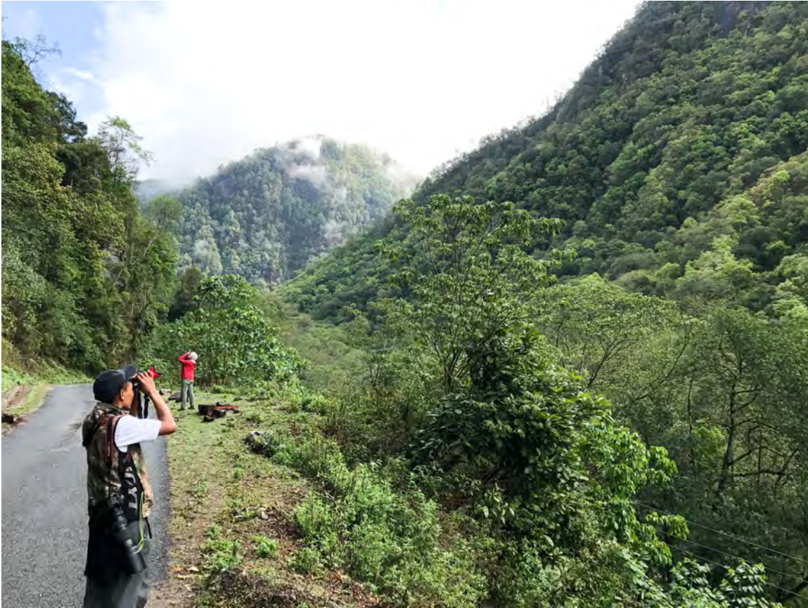
Birding in Bhutan.