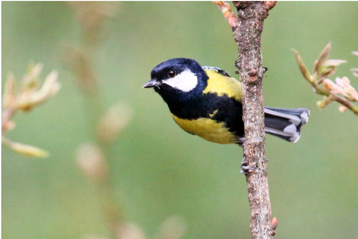
Green-backed Tit, a close relative of the Great Tit.

Day 18. April 5, 2021: Depart Bhutan. Transfer to airport and fly to Bangkok.