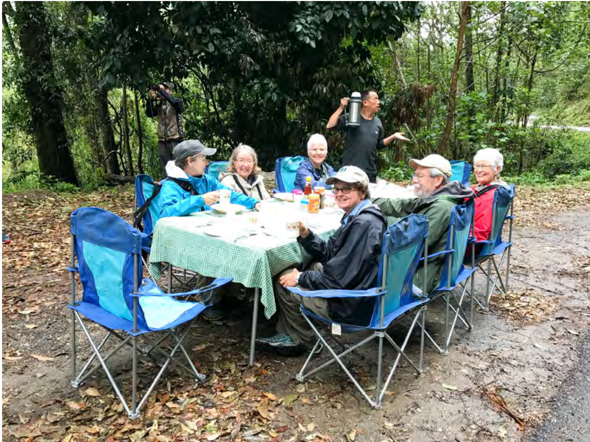
Breakfast time in Bhutan.