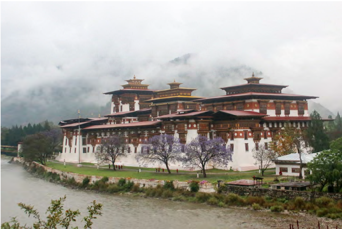
One of the most fantastic buildings you will ever see, Punakha Dzong.