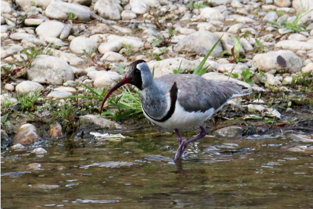
The unique Ibisbill, common in Bhutan.