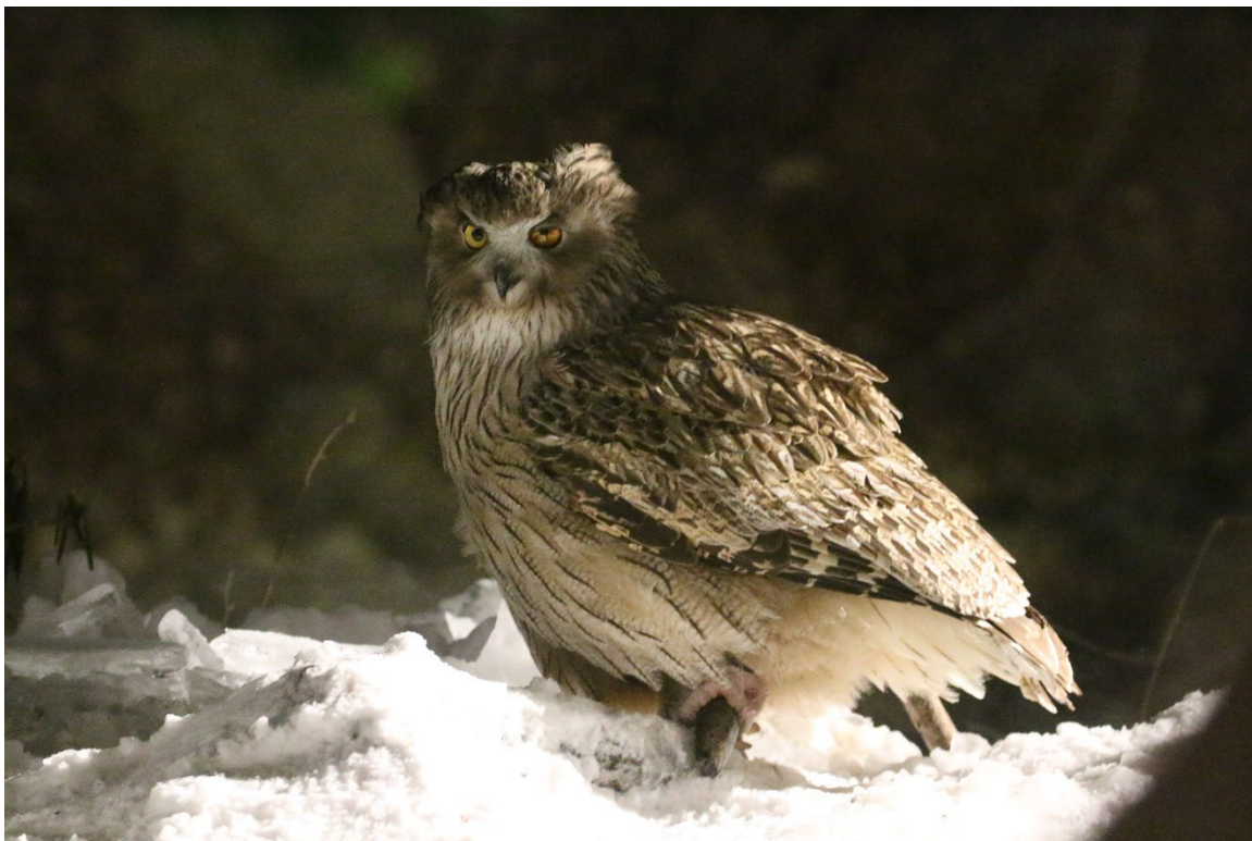
Blakiston's Fish Owl

Note that our hotels are a mix, some are Western style hotel, and others are Japanese style hotels. Japanese hotels may take some getting used to, on some you will sleep on traditional and very comfortable, Japanese futons. Single rooms may not be available in some hotels. Most Japanese hotels have private bathrooms, but not all, we may have to share bathrooms in at least one hotel. Some Japanese style hotels have showers only in the onsen hot springs. Hotels in Kyushu and Hokkaido tend to have natural hot springs that you may want to enjoy. We will be able to sample some wonderful traditional Japanese cuisine as we travel, although lunches tend to be at quicker and in more efficient places including roadside convenience stores which offer a varied and much healthier fare than you would expect from a store such as this in our country. Some of our dinners are feasts, for the palate as well as for the eyes! Note that in traditional restaurants, you may eat at low Japanese tables, again this takes some getting used to for us westerners. It is traditional to take your shoes off in Japanese style hotels. They have slippers there for guests to use, but you may consider bringing your own.