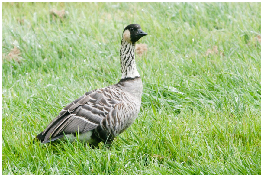
Nene - Hawaiian Goose