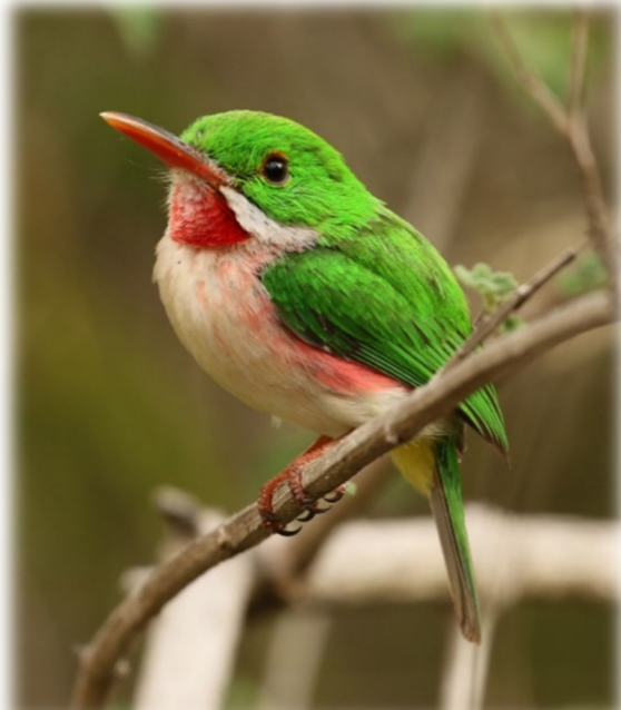
Broad-billed Tody (© Arturo Kirkconnell)

Breakfast at 7:30 am. Departure 8:30. Consisting of about 995 square miles, the unique landscape of Los Haitises National Park is a real natural jewel. Here we plan to search for the critically endangered Ridgway's Hawk, a very rare raptor with a restricted distribution, usually found on a small part of northern parts of the island. In the flowering trees, we