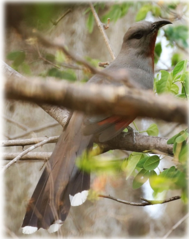
Bay-breasted Cuckoo (© Arturo Kirkconnell)

and finally at the top (the mountains reach to nearly 7000 feet), one will find pine forests. Each elevational change in habitat as a corresponding change in birds, some of them