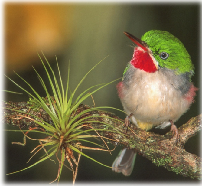
Narrow-billed Tody

the right to decline to accept or to retain any person as a member of any tour. Baggage is at owner's risk entirely.