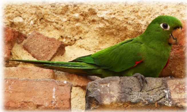
Hispaniolan Parakeet

conditions, we will have an early morning departure at 4:45 am with three 4x4. We will take with us a packed breakfast. It is necessary to reach the forest during the most active period for our target birds, the endemic and endangered La Selle Thrush and Western Chat Tanager. Arriving before sunrise is a must if we want to have better chances to see the endemic Hispaniolan Nightjar, Ashy-faced Owl, and endemic race of the Burrowing Owl. Other species that can be found at Los Arroyos