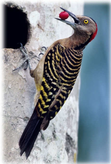
Hispaniolan Woodpecker

May 18, 24. Day 1 – ARRIVAL IN SANTO DOMINGO. Arrival day in Santo Domingo with participants flying in from different destinations. The tour officially starts with a welcome dinner at a fine restaurant in the old town, where we will chat about the plans for the next day and review the target species we will expect to see. Our hotel will be situated close to the center of colonial Santo Domingo, and those who arrive early may wish to explore the nearby historical old section of the city. Please do not forget to carry your binoculars because you could see some of the emblematic birds of the Hispaniolan avifauna such as Hispaniolan Parakeet, Hispaniolan Woodpecker and Palmchat. Night in Santo Domingo at Gran Hotel Europa