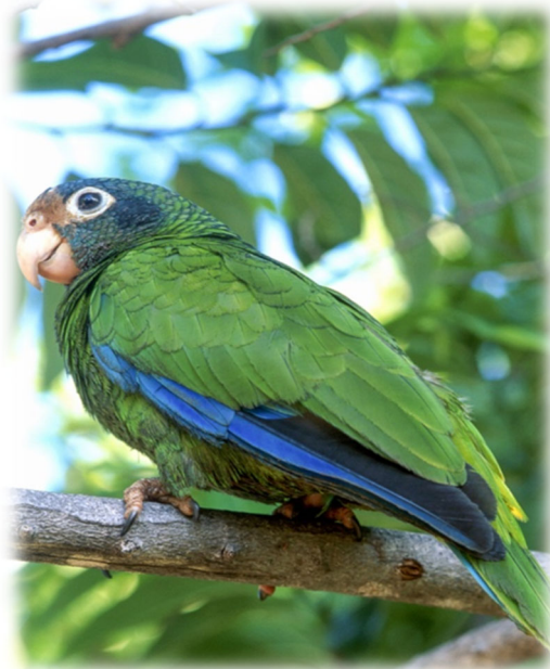
Hispaniolan Parrot

We strongly recommend you consider purchasing trip cancellation (including medical emergency) insurance to cover your investment in case of injury or illness to you or your family prior to or during a trip. Because we must remit early (and substantial) tour deposits to our suppliers, we cannot offer any refund when cancellation occurs within 70 days of departure, and only a partial refund from 70 to 119 days prior to departure (see CANCELLATION POLICY). In addition, the Department of State strongly urges Americans to consult with their medical insurance company prior to traveling abroad to confirm whether their policy applies overseas and if it will cover emergency expenses such as a medical evacuation. US medical insurance plans seldom cover health costs incurred outside the United States unless supplemental coverage is purchased. Furthermore, US