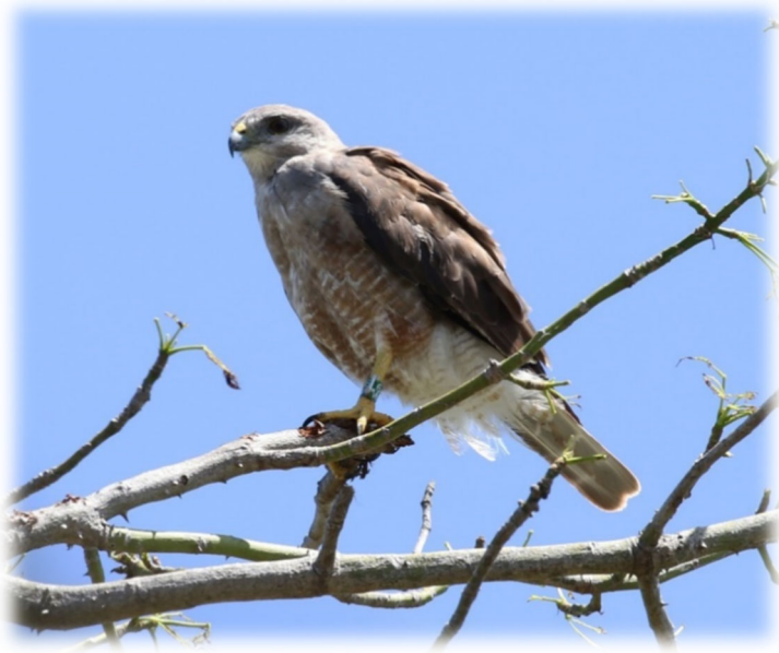
Ridgway's Hawk

number of blank pages for the entire journey, Dominican Republic generally asks for two pages for entry and exit stamp.