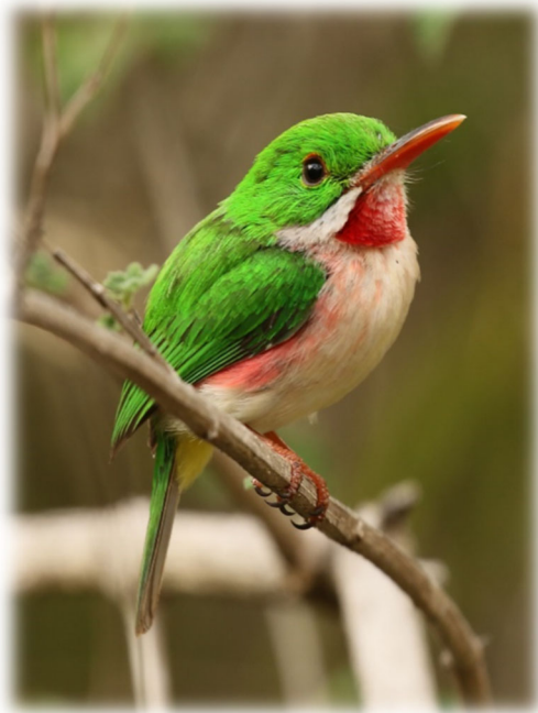
Broad-billed Tody

Lunch in Santo Domingo. In the afternoon we will focus our birding in Las Salinas de Baní wetlands (about 1.5 hours from the capital). Most of the avifauna here can be seen from the roads. We will start our birding along the mangrove edges in search of the Caribbean race of Clapper Rail, Golden Warbler (Yellow Warbler resident population), Brown Booby, Brown Pelican and American Flamingo. A high diversity and numerous shorebirds could be seen here, including Black-necked Stilt, Black-bellied Plover, Snowy, Wilson's, Semipalmated, and Piping Plovers, Whimbrel, Ruddy Turnstone, Sanderling, Stilt, Least, Semipalmated, Western and Spotted Sandpipers, Pectoral Sandpiper, Red Knot, Short-billed Dowitcher, Willet, Royal Tern, Least Tern and Common Tern, Herring Gull, herons and egrets can also be found here. Also, Merlin and Peregrine Falcon. We expect to arrive to Barahona around 6:30pm. Night and dinner in Barahona. Hotel Quemaito