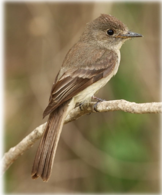
Hispaniolan Pewee

TOUR INCLUSIONS/EXCLUSIONS: The tour fee is $4500 for one person in double occupancy starting in Santo Domingo, Dominican Republic. It includes all lodging from Day 1 through Day 11, all meals from dinner on Day 1 through breakfast on Day 10, all ground transportation, entrance fees, tips for baggage handling and meal service, and the guide services of the tour leaders. Alcoholic beverages and items of a personal nature are not included. The above fees do not include your airfare to and from Dominican Republic, airport taxes, visa fees, travel insurance, optional tips to local drivers, phone calls, laundry, or other items of a personal nature.