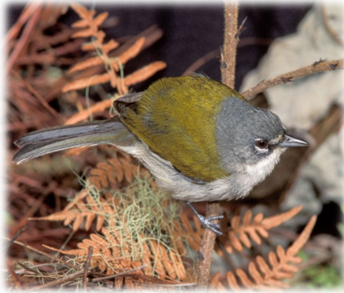
White-winged Warbler

May 22, 24. Day 5 – RABO GATO TRAIL AND PUERTO ESCONDIDO. We will