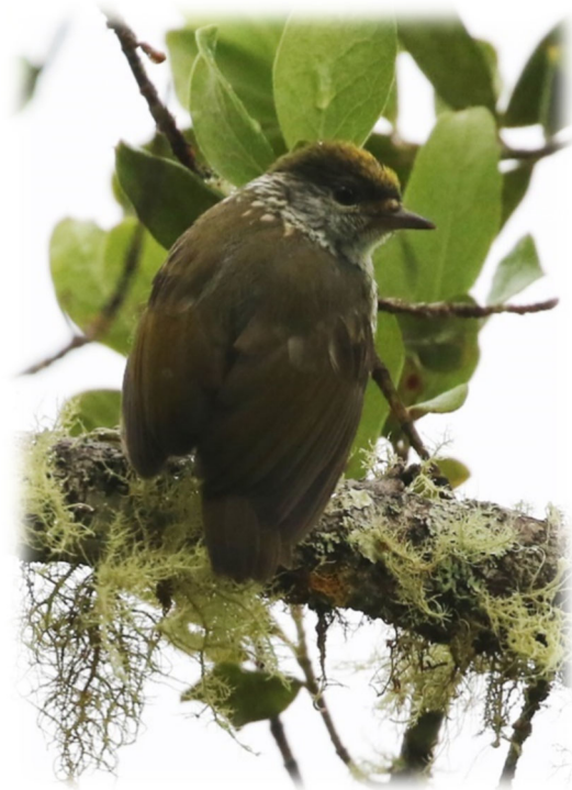
Antillean Piculet (© Arturo Kirkconnell)

purchased separately often carry penalties for cancellation or change or are sometimes totally non-refundable. Additionally, if you take out trip insurance the cost of the insurance is not refundable, so it is best to purchase the policy just prior to making full payment for the tour or at the time you purchase airline tickets, depending upon the airlines restrictions.