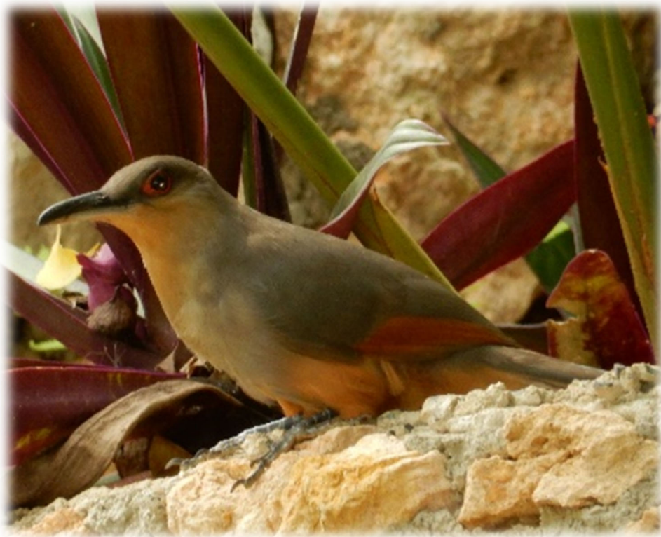
Hispaniolan Lizard-cuckoo