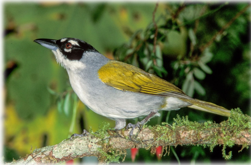
Black-crowned Palm-tanager

Well known for its cigars, rum and baseball players, the Dominican Republic forms one half of the island of Hispaniola, the second largest of the Antilles. Santo Domingo is one of the oldest colonial cities in the New World, and the capital city of the Dominican Republic. Our visit to the Dominican Republic will be enriched by the hospitality of its people and their wonderful Caribbean-style cuisine.