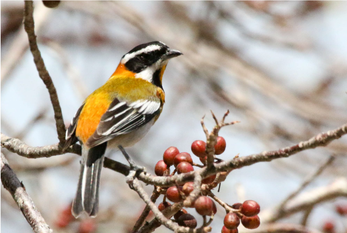
Western Spindalis – green backed Cuban population